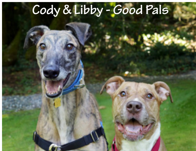
Cody & Libby - Good Pals