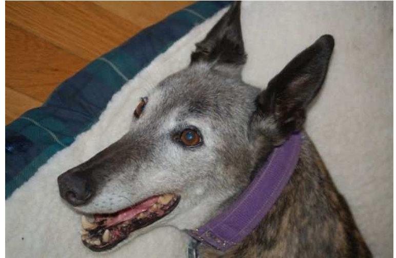
Tag #2321 Registered Name: Tagget Call name: Tag