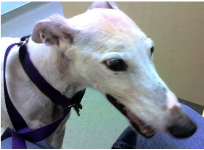
Tag # 1848 Registered Name: Gadabout Gus Call Name: Spooky

After many years of being my best friend has passed over the Rainbow Bridge. He almost made it to 15 years old. He never said a bad word about anyone. I will miss him.