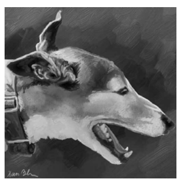
Street Waltz — Walter Art by Xan Blackburn

It's a new year!! Time to look back and time to look forward. This last few months have been difficult, as we all dealt with floods, snowstorms and power outages. We had 2 feet of water surrounding our house, the snow wasn't too bad, but we had no power for almost 6 days. Our survival skills really kicked in!! The thing I most remember about the past few months is losing Walter. Walter was diagnosed with Osteosarcoma (bone cancer) the second Wednesday of September. It was just a little bump, the size of a pea. By mid November, it was the size of a plum, surrounding his ankle, making it impossible to straighten his leg and put weight on his foot. Walter was the ambassadog supreme...humans were made to pet him and pay attention to him. When they didn't, he'd lean his almost 90 pound body against their legs and MAKE them notice him. He has left a huge hole in our hearts, and many many happy memories in our minds. But still, we soldier on.