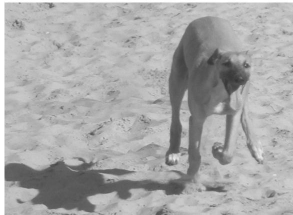
P E A N U T