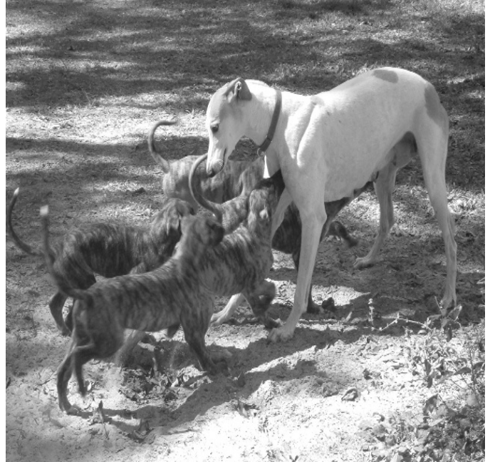
Momma Banjo gives some loving to her 5 brindle boys: Chase, Dallas, Roux, Vito and Pippin

Visit our website at www.m-mcreations.com Visa and Mastercard accepted mmcreations2@direcway.com 425-333-0515