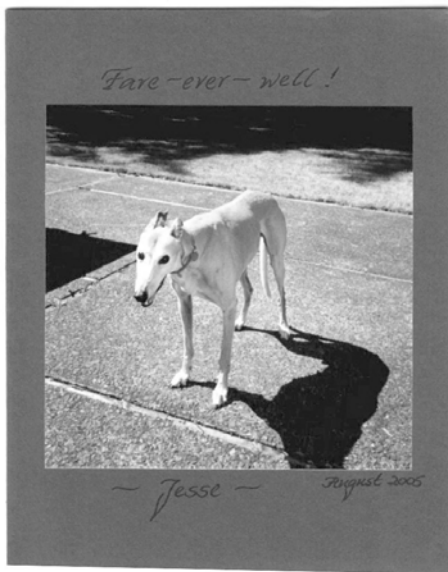
Jesse GK's Unruly Jess Tag #1274 July 1992-September 2005

The first time I saw Jesse it was destiny. He was a "return" dog and thrown in with a wild bunch fresh off the track. There he sat, shaking uncontrollably trying to shrink into the background. Thus our wonderful journey began. After one month of dealing with Jesse's anxiety - driven stubbornness - I almost gave up. He would not let me do that! It was the first of many turning points. For about one year we took turns being teacher and student.