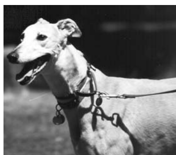
Cookie Canadian Cookie Tag # 1655 April 25, 1991 – June 23, 2005