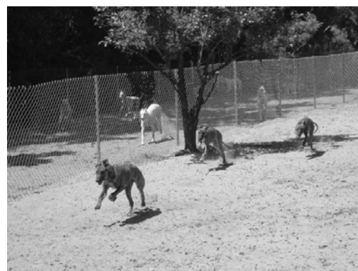
Learning to RUN!!