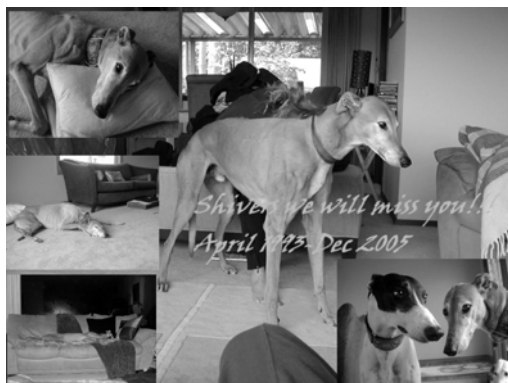
Shivers Cold Shivers Tag #1993 April 1993 - December 2005

One summer day I was diving through Hollywood, Florida with my uncle and decided to stop at the Greyhound race track. I looked inside and saw these amazing dogs running on the track. At that time, I never thought I would be the owner of a Greyhound.